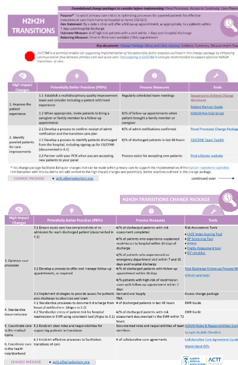
Figure 1. H2H2H Transitions Change Package Summary

The frequency and timing of measurement for quality improvement is at the discretion of the clinic, and dependent on the behaviour change and measure being tracked. It is recommended that measures are collected as frequently as possible without adding burden. For example, weekly measurement of discharges or admissions may be appropriate. Data can be entered into a simple Excel spreadsheet and run charts may be created to support interpretation. See Tools & Resources for Implementing Change for more details on run charts.